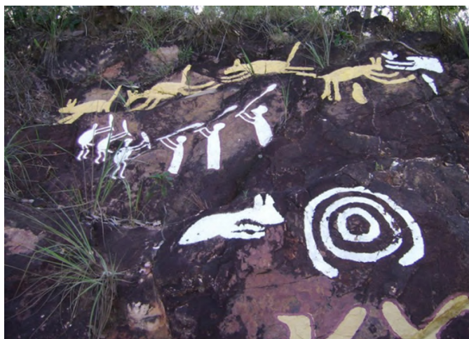
Figure 2. Cave painting reproductions from the site.

According to the official website ( http://www.paulobertran.com.br ), the area was given this name because it represents the “three ages” of the central highlands formation. The first age is the “geological age”, represented by the rocks and stones, some of them up to 1 billion years old and originally under the Pangean sea. The second is the “anthropological age”, represented by reproductions of ancient cave paintings made by local artists (Figure 2). The third age is the “plant age”, represented by the trails through the area of Cerrado sensu stricto in which the survey was done.