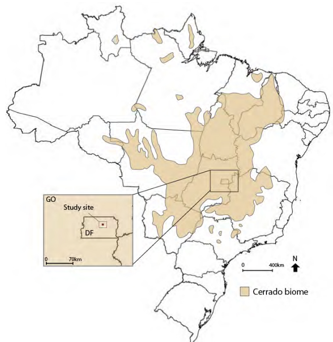
Figure 1. The original area of Cerrado Biome in Brazil (based on Ratter et al. 1997) and the study site location within the biome. DF: Distrito Federal, GO: Goiás state.

The Distrito Federal of Brazil (DF) is located in the center of the Cerrado biome (Figure 1) and has suffered from increasing exploitation of its natural resources.