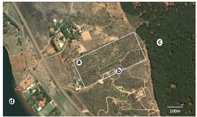
Figure 3. Aerial view of the Brazilian Ages Memorial and region on Google Earth™. a) Area in which our floristic survey was done; b) Brazilian Ages Memorial museum; c) Pinus sp. plantation.; d) Paranoá Lake.

The site of study is a Cerrado sensu stricto located at an altitude of 1,050 m with approximately 6 ha attached to the Brazilian Ages Memorial Museum. The site is close to a large plantation of Pinus sp. which has already started to invade the area’s native vegetation via seed dispersal (Figure 3).